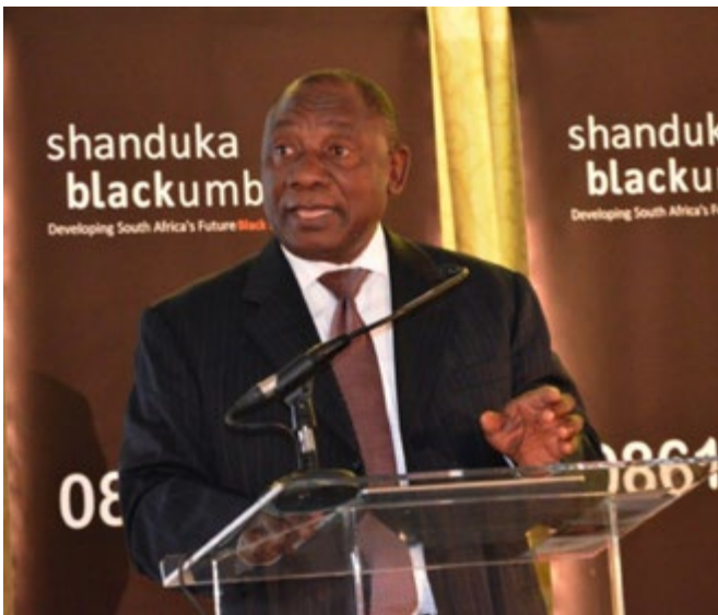
Mr Cyril Ramaphosa, Deputy President of the Republic of South Africa and Chairperson of the Cyril Ramaphosa Foundation

Modi Mining, a diversified mining services provider, received the Best Performing Company award , and Kopedi Business Enterprises a company offering comprehensive services in construction and civil works walked away with the Most Jobs Created award .